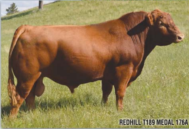
REDHILL T189 MEDAL 176A