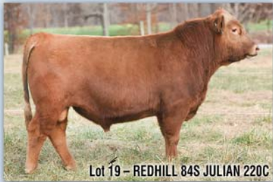
Lot 19 – REDHILL 84S JULIAN 220C