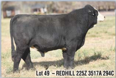
Lot 49 – REDHILL 225Z 3517A 294C