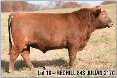
Lot 18 – REDHILL 84S JULIAN 217C