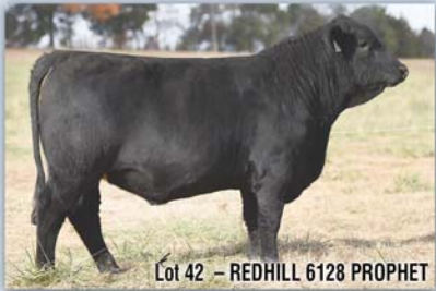
Lot 42 – REDHILL 6128 PROPHET