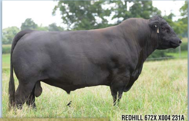
REDHILL 672X X004 231A