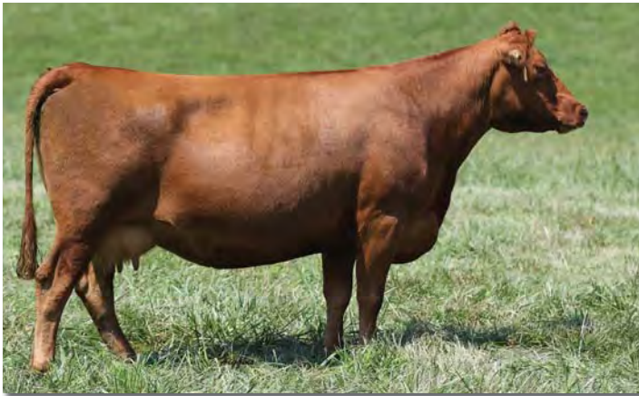
REDHILL 151X PRIDE 258Z

These embryos are black/red carriers. We flushed 258Z to her opposite – SYDGEN ENHANCE. ENHANCE is the high output Angus bull with top 1% YW (155) and 1% MARB (0.93) in Red Angus. ENHANCE brings stellar indexes – 226 ProS (1%), 98 HB (15%), and 128 GM (1%).